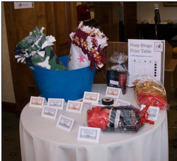
At Pony Bingo, Hope Springs shared facts about the organization while supporters won prizes.