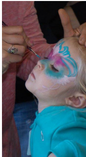
Beautiful work by Crazy Faces Face Painting

We are looking forward to our annual fundraiser, Hopes and Dreams, which will be held on Sunday, October 9th from 11:00 a.m. to 3:00 p.m. at the Whitford Country Club in Exton, PA. All proceeds from this family-friendly brunch event directly benefit the riders of Hope Springs.