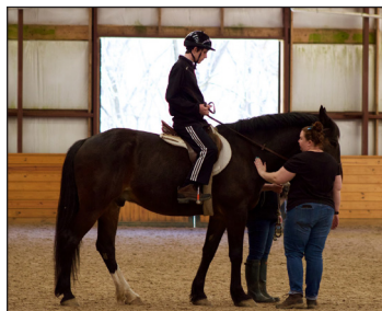
Peace by Piece's indoor ring is helping Hope Springs to continue lessons in inclement weather.